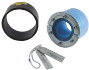
RS W Ex kit

For detailed information, please visit roxtec.com .